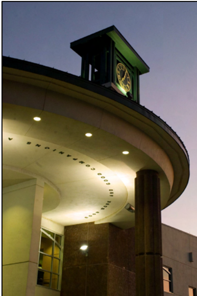
FGCU Student Union Fort Myers, Florida