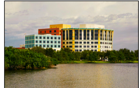
LMHS - HealthPark Medical Center Fort Myers, Florida